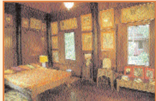
Typical Thai bedroom in Jim Thompson's House