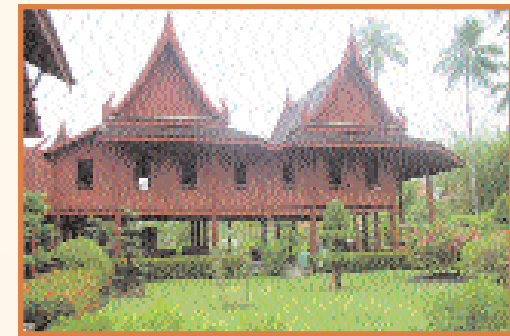
King Rama II Royal Commemorative Park

Sunday, February 6 After breakfast, drive to Chiang Dao to visit an elephant camp where you will see the elephants taking their morning bath and demonstrating some of their skills. Learn about the elephants