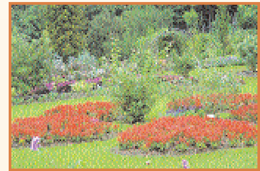
Royal Angkhang Agricultural Station Project

style of eating with food served on large platters at low tables while you sit on mats on the floor. As you enjoy your meal, let yourself be entertained by a selection of northern cultural performances.