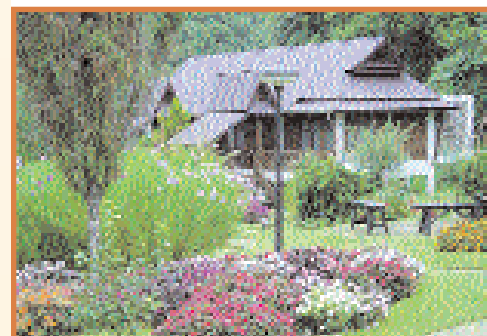
Above: Angkhang Nature Resort, Below Left: Grand Palace, Bangkok, Below Right: Gardens at Jim Thompson House

PRSR STD U.S. Postage PAID Clarendon Hills, IL