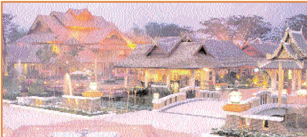
Khum Kantoke Dinner

Return to the hotel for leisure time before enjoying a superb Kantoke Dinner , a traditional northern meal beside a roaring log fire in a lantern-lit glade. Kantoke is the customary northern Thai